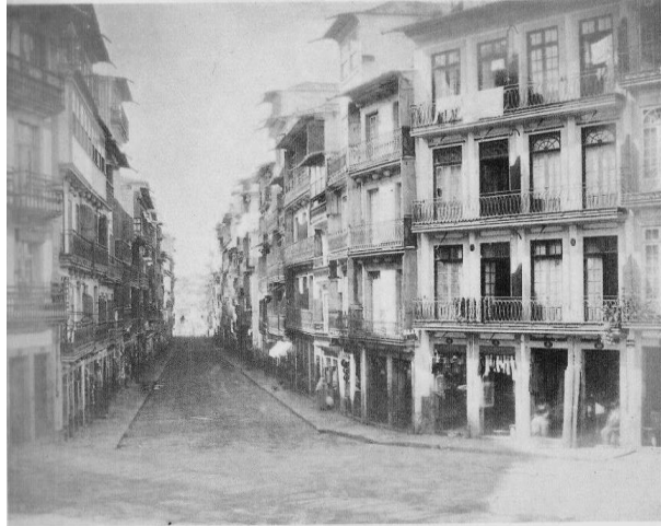
Figure 1. Rua das Flores (Street of Flowers) - view from the Porta dos Carros - 1849/1859.

Pedestrian itinerary along the quartier Mousinho da Silveira / Rua das Flores – from the regular layout of the mercantilist urban consolidation to the formal and functional paradigm of the urban richness of the eighteenth century. Retrospective of urban evolution of the area of business in the context of the current dynamics of the historic center of Porto.