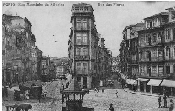
Figure 2. West view of Rua das Flores / Rua Mouzinho da Silveira .